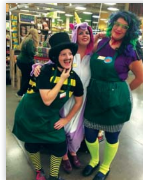
HALLOWEEN AT HOLLYWOOD FRED MEYER!