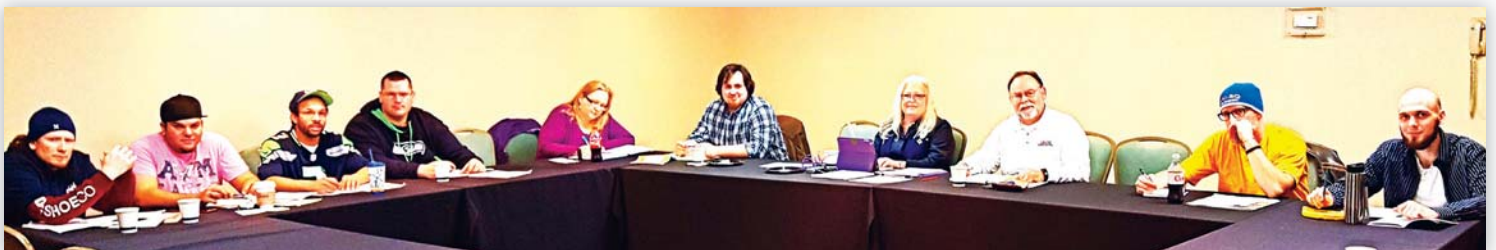
FOSTER FARMS BARGAINING COMMITTEE —UFCW Local 555 and the Foster Farms bargaining committee met with the employers for the first round of bargaining for a new contract on October 13th and 14th, 2016 in Kelso, WA. As you read on the first page of this month's paper, the five-year contract was successfully ratified!