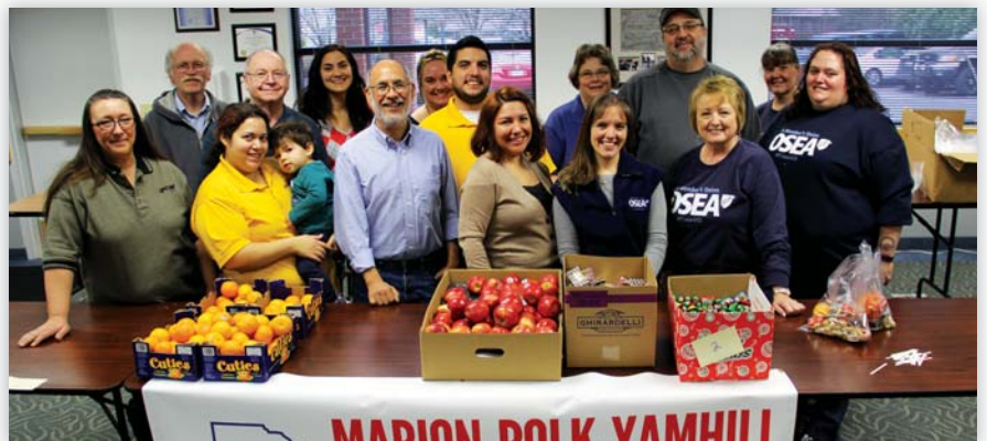
MPYCLC’S 76TH ANNUAL CHILDREN’S HOLIDAY PARTY —All the children of Marion, Polk, and Yamhill counties (and their families) were invited to this annual party for live Christmas music, a showing of the movie “The Polar Express,” goodie bags for the kids, and—naturally—a visit from Santa Claus.