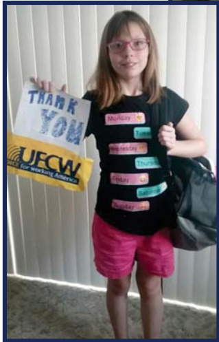
Members and their children in Southern Oregon sent in pictures to say THANK YOU to Member2Member for helping with their school supplies this year. The Member2Member committee replies, "These pictures are warming our hearts. You're so very welcome!"